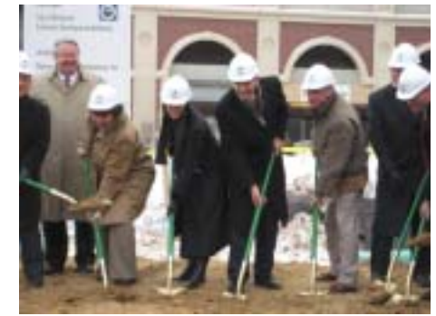
Groundbreaking, December 2007

Construction of the Minnesota BioBusiness Center began in November 2007. The key tenant for the building is the Mayo Foundation for Medical Education and Research who will lease five floors. Space on the remaining three floors will be dedicated to a combination of ground-floor retail and biobusiness companies other than Mayo. The building is designed so that six additional floors could be added later. Total cost of the project, with the expansion of the First Avenue parking ramp, is approximately $34 million.