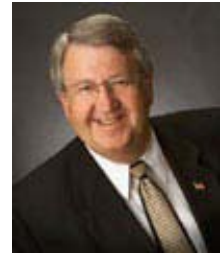
Ex-Officio Mayor Ardell F. Brede City of Rochester